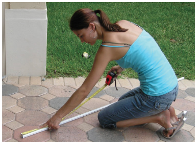
2. Measure Track Cover to exact size